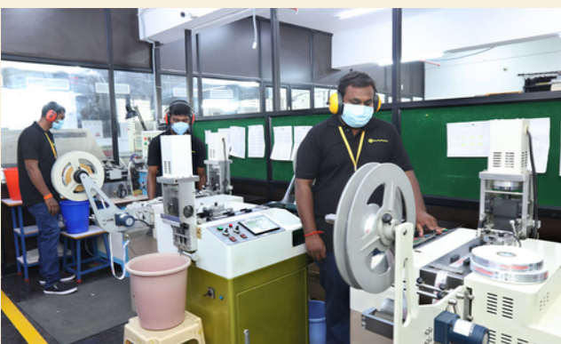
Ultrasonic Label Sealing & Folding