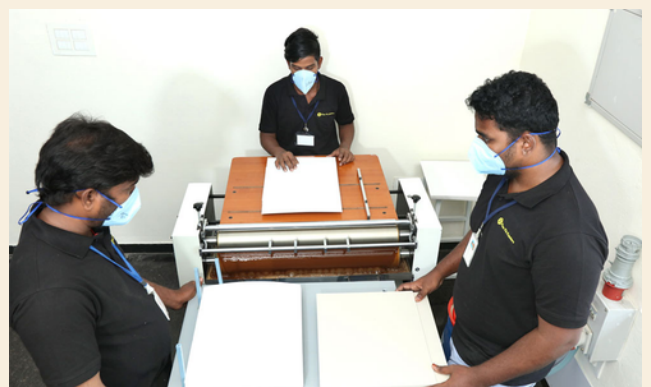
Gluing & Pasting