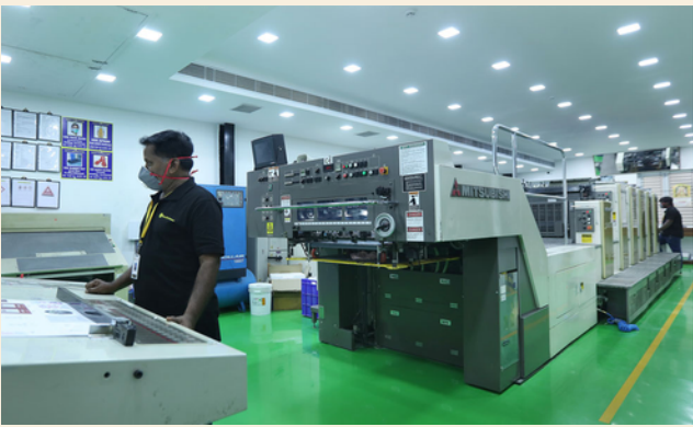
Five Colour With Aqueous Coater