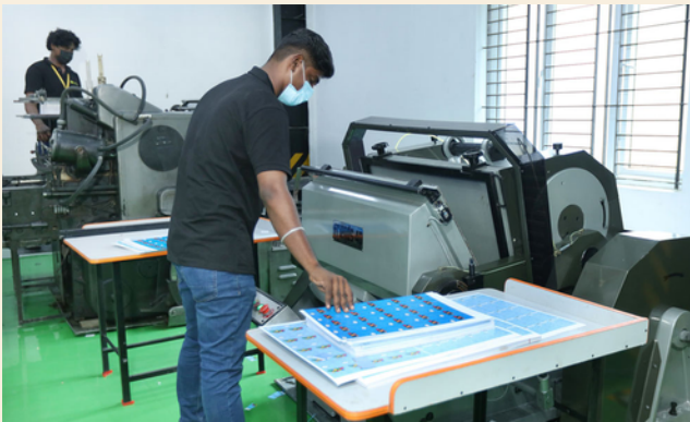
Heavy Platten Die cutter