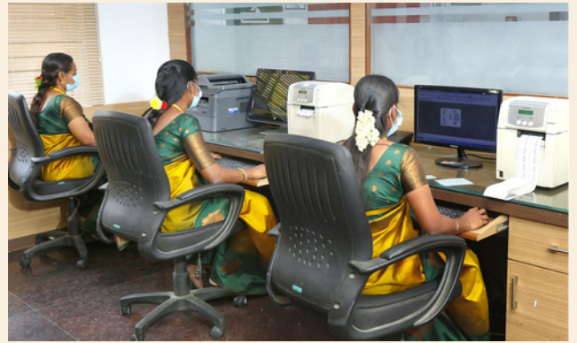
Barcode & RFID Printing