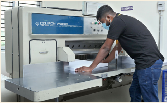
Automatic Board Cutter