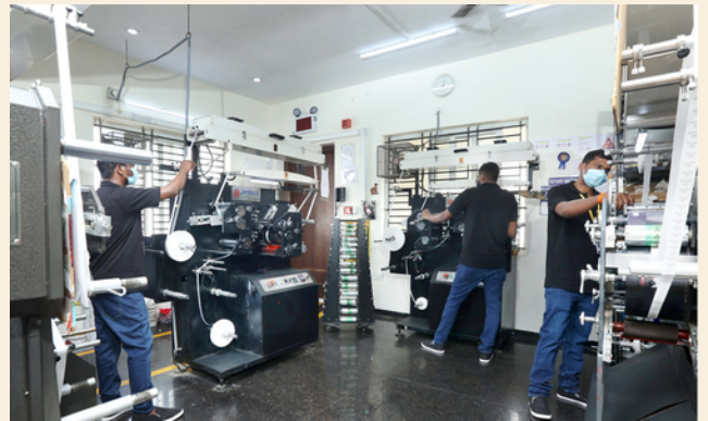
Rotary Label Printing