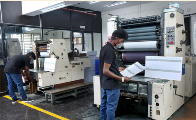
Varnishing & Aqueous Coating