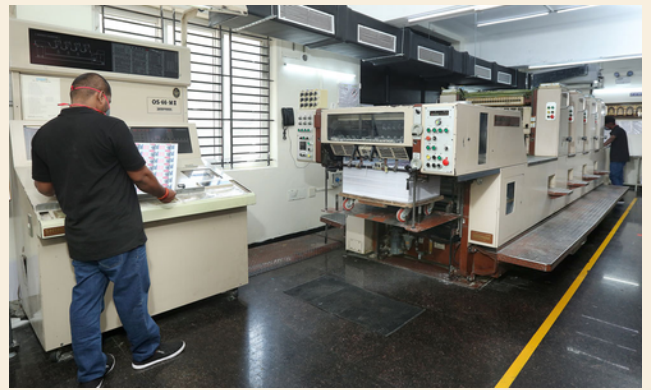
Four Colour Offset